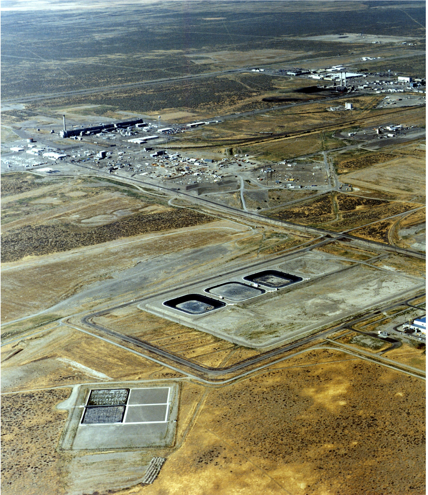
The 200 Area of the Hanford nuclear site is seen in a 1995 aerial photo.

For example, Energy Department officials estimated $18 billion in savings from prioritizing high-risk over low-risk waste at the Hanford site in Washington state. The department has yet to determine what it will do with as much as two-thirds of the low-risk waste at Hanford. The Hanford site cleanup came under increased scrutiny after a "take cover" order was given in 2017 after a tunnel containing radioactive waste collapsed.