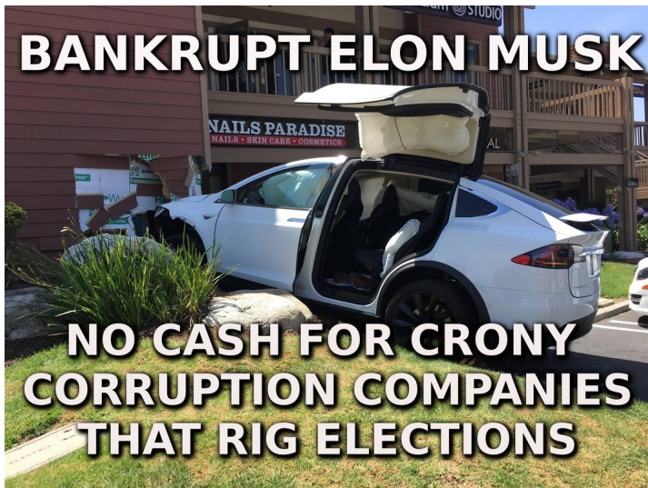
Tesla's out-of-control sudden-acceleration surge defects and exploding batteries are not as bad as Tesla's out-of-control corruption and bribery.